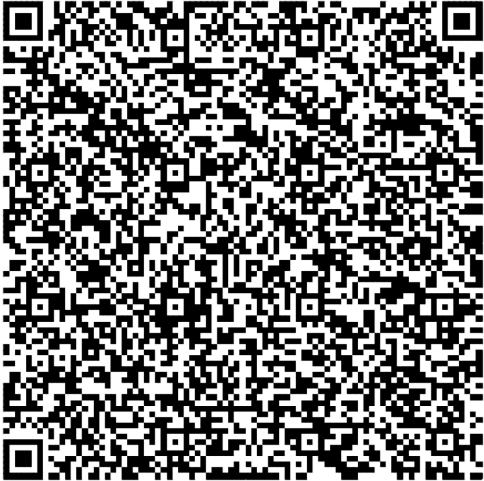
MAIDS OF ARDATH, The