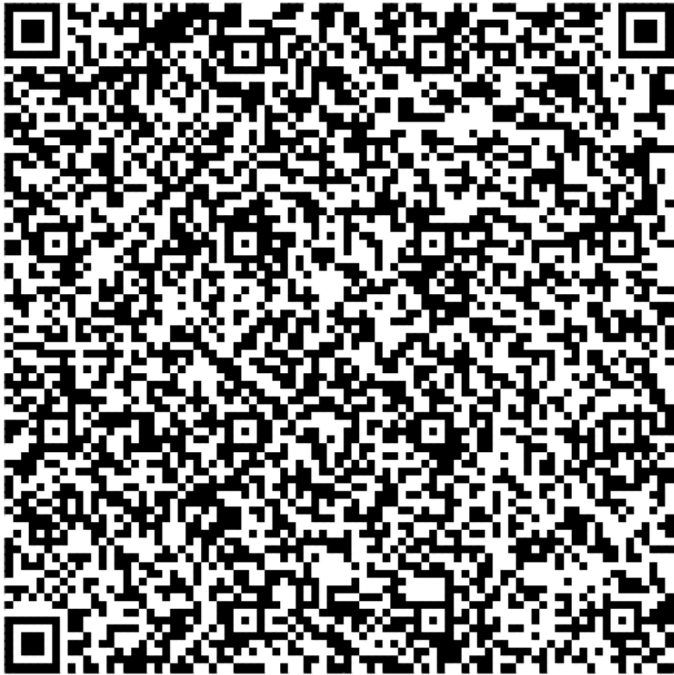
ROARING MARY (reel)