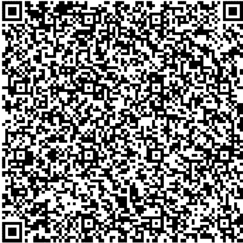
EARL'S CHAIR (reel), The